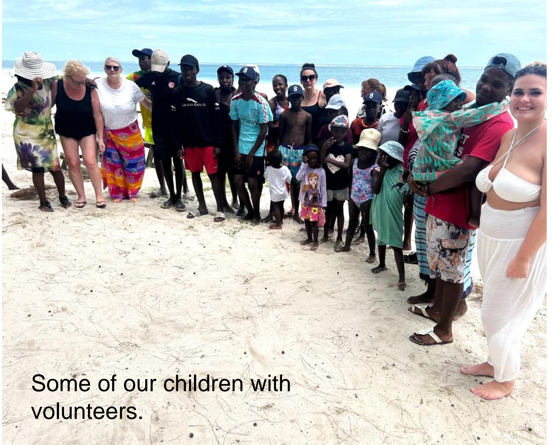
Some of our children with volunteers.