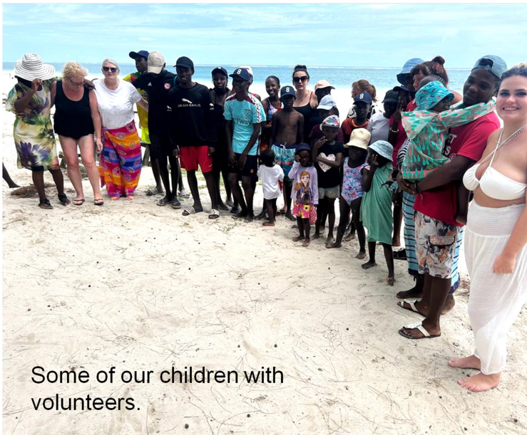
Some of our children with volunteers.