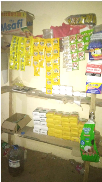
A shop we built in our eldest boys village. Juma now has a little business.

Interview can be seen at 29:45 in last week's service online .