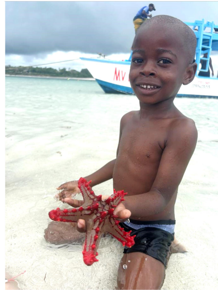
Kinggy never knew how to smile or cuddle. Look at him now!