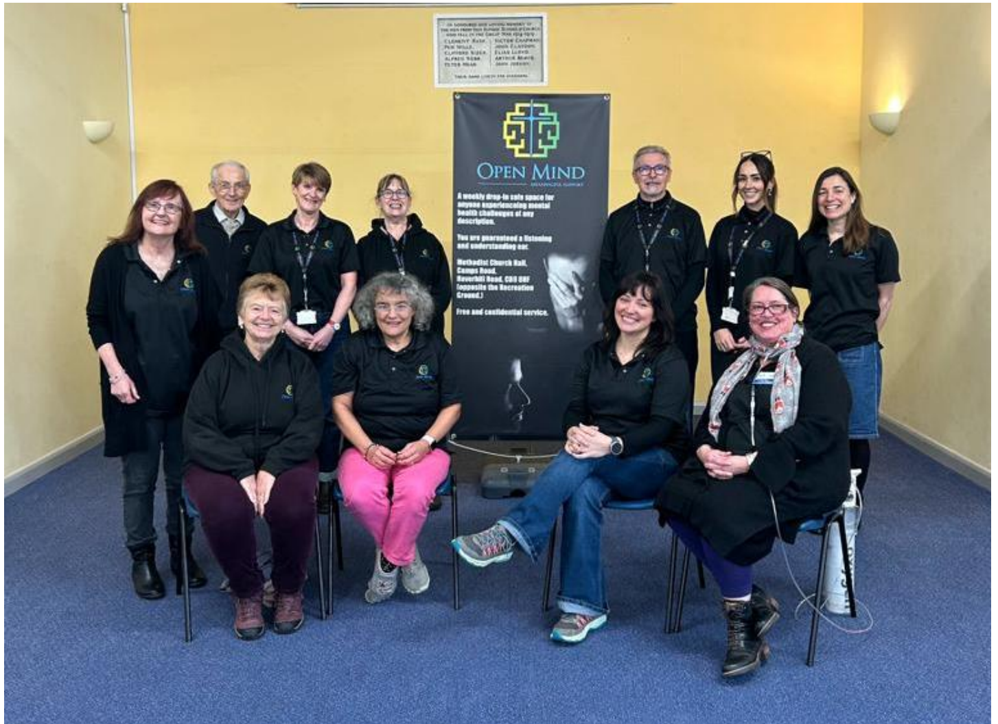
The Open Mind Team